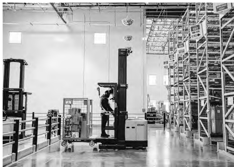
The market is still extremely tight, with availability of space still below prepandemic levels.

The gap between falling demand and rising prices is in part the result of particular dynamics of the industrial real-estate market, experts say, where warehouse operators and their customers typically sign deals for three to five years, basing leasing decisions